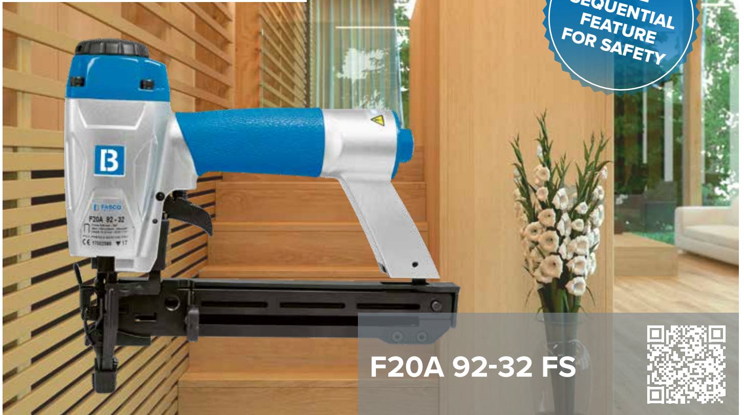
F20A 92-32 FS